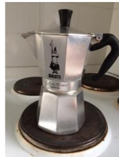
Il caffè è pronto.