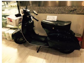
Ecco una vespa!

All entries need to be in by Monday 25 June. Winners will be announced at Carnevale, the last day of term. Prizes will be awarded for the best entries.