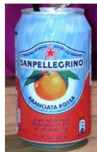
Mi piace bere l'aranciata rossa.